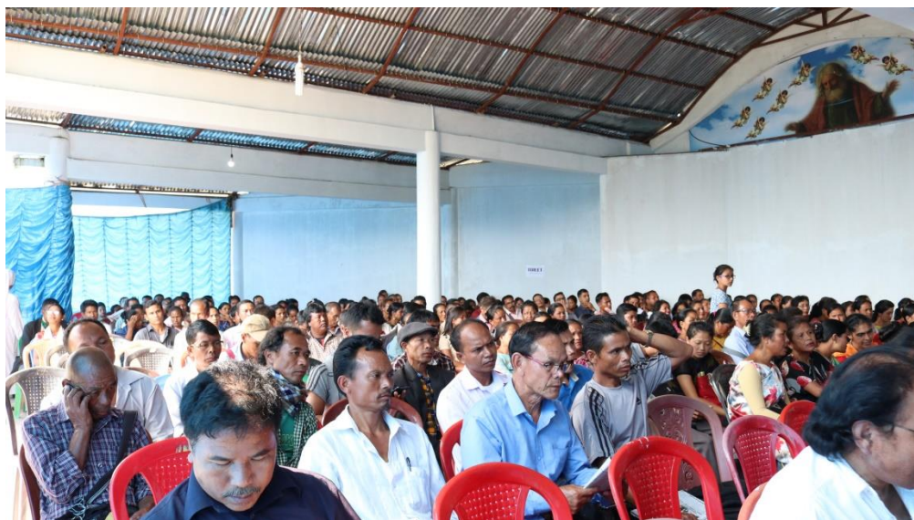
(A section of the Participants)

On record the number attended was 205, with 116 Head Teachers, 11 Headmen, 54 teachers, 3 Vice Principals, One President of School, 3 Secretary of School, 3 Asst Headmaster, 9 Cluster Resource Persons and 1 Block Resource Person, and a representative from a NGO, village. (However, based on head count the number of participants exceeded 300)