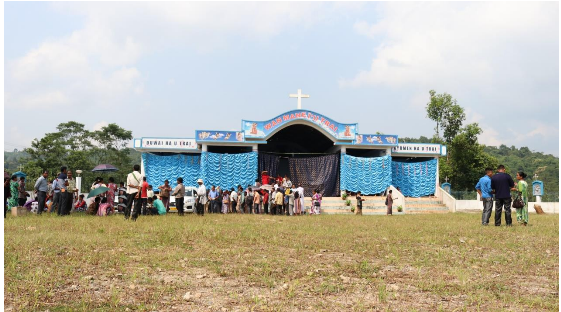
(A view of the venue)

T he Orientation programme was held on the 5 th October, 2018 at Mawbri Parish Hall, Bhoirymbong, as it is the only venue which could accommodate more than 300 participants in the area. The programme started at 10:30 AM and lasted for more than 90 minutes.